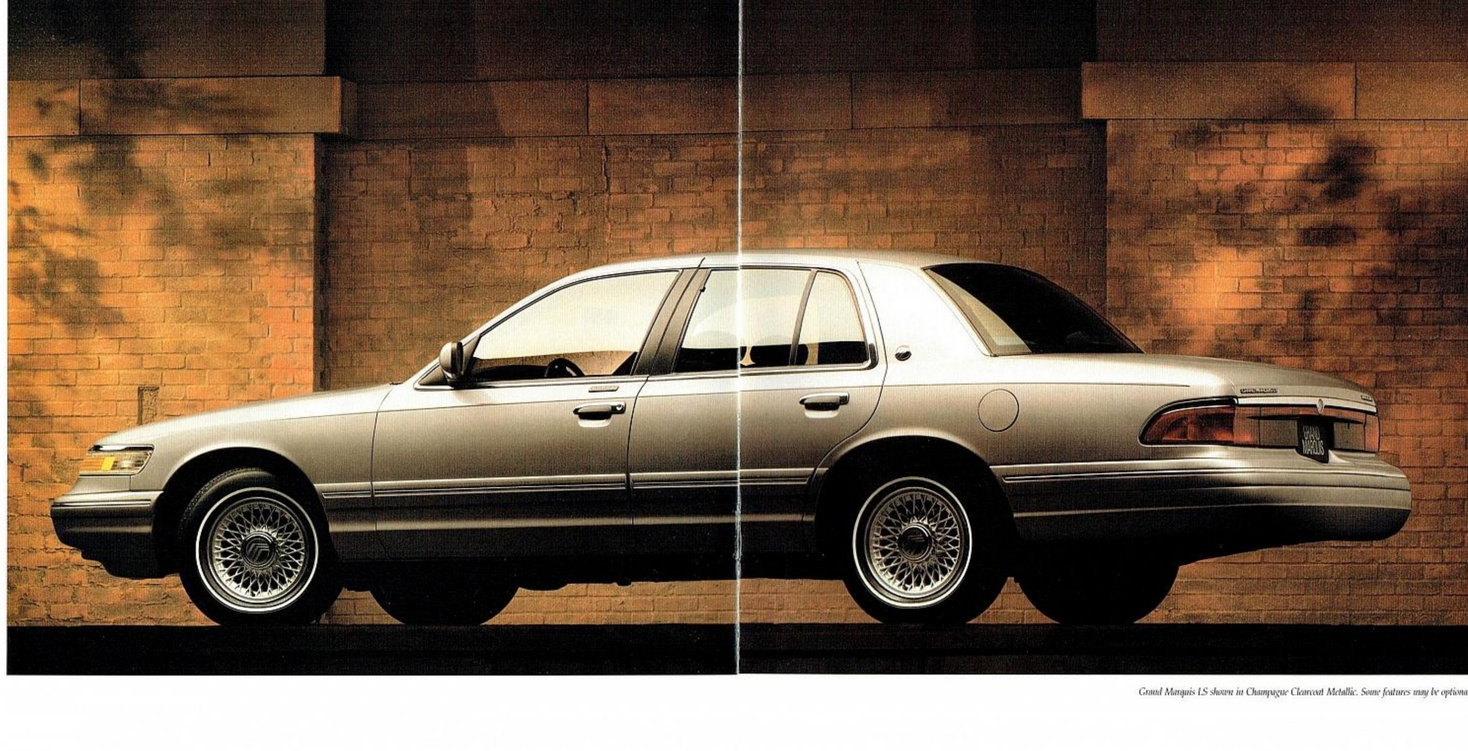
Grand Marquis LS shown in Champagne Classic Metallic. Some features may be optional.